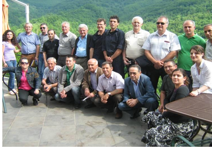
Figure 5: REFORD Assembly meeting, Kosovo, June, 2011

While sharing similar challenges about private and communal forestry the three associations were exchanging and building their relationships. Using the existing local organizations and their capacities they initiated discussions about joining forces in addressing concrete common issues and finding solutions on regional level. The CNVP/Sida forestry project provided a platform for this vision and encouraged the associations to start structuring their regional ideas.