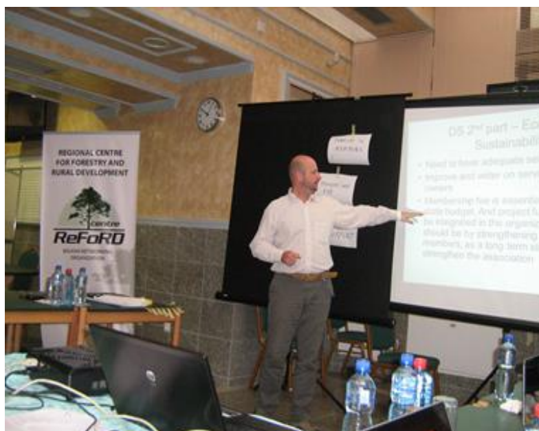
Figure 12 REFORD facilitating FAO regional workshop "Supporting non-State forestry in South East Europe"

Currently the main income for the associations is derived from donors via projects. This is logical since support was needed in the start and set up of the family forestry structures. Dependence on such support however should not remain long term and needs to be diversified with other sources and gradually taken over by other sources. Depending on the level of development of the associations; membership fees and project implementation is providing already some income.