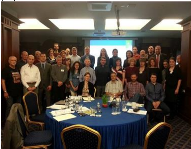
Figure 7 Group picture during the FAO Technical Workshop on Voluntary Guidelines on the responsible governance of tenure of Land, Fisheries and Forests

REFORD aims to be an umbrella organization for all private and communal forest owner associations in the region. Strengthening its position in the wider Balkan region REFORD strives to become recognized service provider in the fields of forestry, rural development, natural resource management and biomass utilization (especially wood biomass). While expanding the network further through the region REFORD is improving the position of private and communal forestry and contributes to enhance rural economy and life of local people.