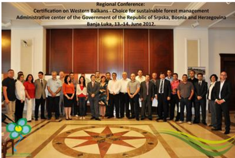
Figure 11 Representation of PFO's on a Regional Conference

In Kosovo a start is made with developing management plans for small scale private forest, while in Albania forest management planning through forest parcel plans and some wood products business plans started. Developing business services for owners and users provided a direct service requested for by people and is linked to the development of the associations as this is an important role of the associations and is important for the associations own financial sustainability.