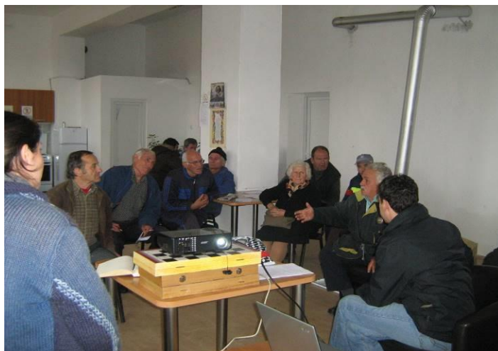
Figure 2: One of the meetings to improve internal structure in NAPFO Macedonia

independent entities at municipal level as APFO. In 2010, 9 local associations with 330 members were established in addition to the national association. In 2011, the number of local associations increased to 16 with 640 members, while the national association was reorganised and became the National Association of Private Forest Owners (NAPFO) as network and umbrella organisation representing the local associations. In 2012, the number of members of the 16 associations increased to about 3,600 while the establishment of additional associations was in process. The project has established associations in all municipalities (16) of three regions in Kosovo, while an additional two are in process outside of these regions.