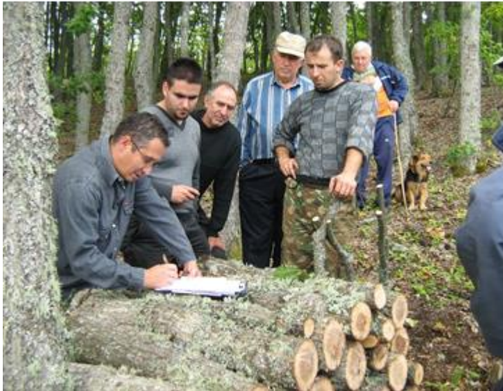
Figure 10 Delivering training for private forest owners in Macedonia

In Kosovo a start is made with developing management plans for small scale private forest, while in Albania forest management planning through forest parcel plans and some wood products business plans started. Developing business services for owners and users provided a direct service requested for by people and is linked to the development of the associations as this is an important role of the associations and is important for the associations own financial sustainability.