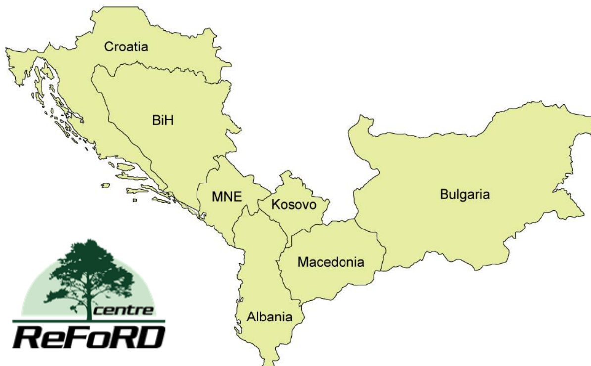
Figure 6: REFORD coverage in the Balkans

In the spring of 2010 on the Assembly meeting held in Brezovica, Kosovo was decided that official members of REFORD are only legal entities. REFORD is a network organisation of which only other organisations in the field of family forestry can become members. To address this in the end of 2011 through two preparatory meetings the member associations from Albania, Kosovo and Macedonia discussed about the organizational structure, statute, election bodies and other issues that needed improvement. On the Annual meeting held December 2011 in Albania the associations from Albania, Macedonia and Kosovo voted for changes in the Statute and formed new board with proper representation of members.