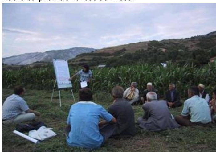
Figure 3: One of the early meeting of the Communal Forest Association in Albania

In Macedonia in 1997 a group of private forest owners established APFO - Association of Private Forest Owners in Macedonia. In 2006 APFO was still a small association with about 35 members and mainly focused on lobbying for legal adjustments to support private forestry. From 2006 onwards APFO supported by the SNV/CNVP forestry programme improved its internal structure by having one head office in Berovo, 5 regional offices, 25 branches and increased the membership to over 1600 members. Through these new developments APFO became a national association representing all private forest owners in Macedonia (NAPFO) with a main mission to address and protect the private forest owners and users individual and common interests. With the continued support of the CNVP/Sida project NAPFO was able to further strengthen its capacities. Effective lobbying brought for the first time some positive changes in private forestry. A significant policy achievement was the active involvement of NAPFO in process of coming to the new Forest Law in 2008 which was amended in later years. NAPFO was included as one of the main stakeholders in the process. Through their lobby NAPFO managed having the possibility for licensed forest engineers to provide forest services.