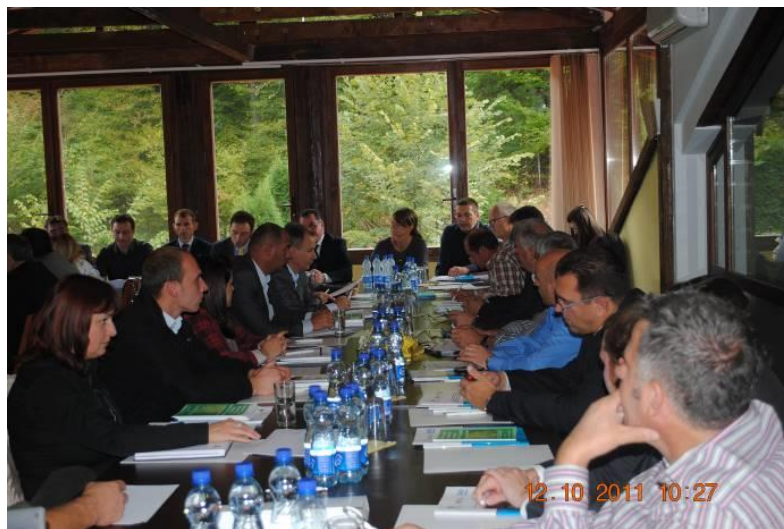
Figure 1: Meeting in Kosovo

Each organization has been supported on organizational development through the (SNV former CNVP) forestry program support aiming on growing in to a strong and functional organization representing the private and communal forestry in their respected countries. The forestry support programmes and especially the CNVP-Sida forestry project provided also the opportunity for a more regional focus and involvement of the Association of Private Forest Owners (APFO) from Kosovo. Developments and cross border activities between the associations for family forests (private and communal forestry) from Albania, Kosovo and Macedonia where intensified and more result oriented after 2009 by starting the "Strengthening sustainable private and decentralized forestry" project with financial and technical assistance supported by SIDA-SNV.