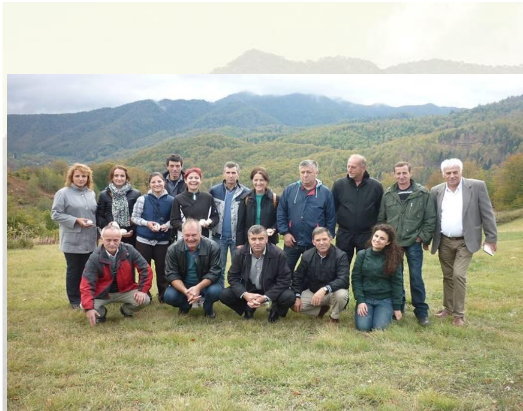
REFORD network Developments of a Regional Network of Forestry Associations

Connecting Natural Values & People Foundation