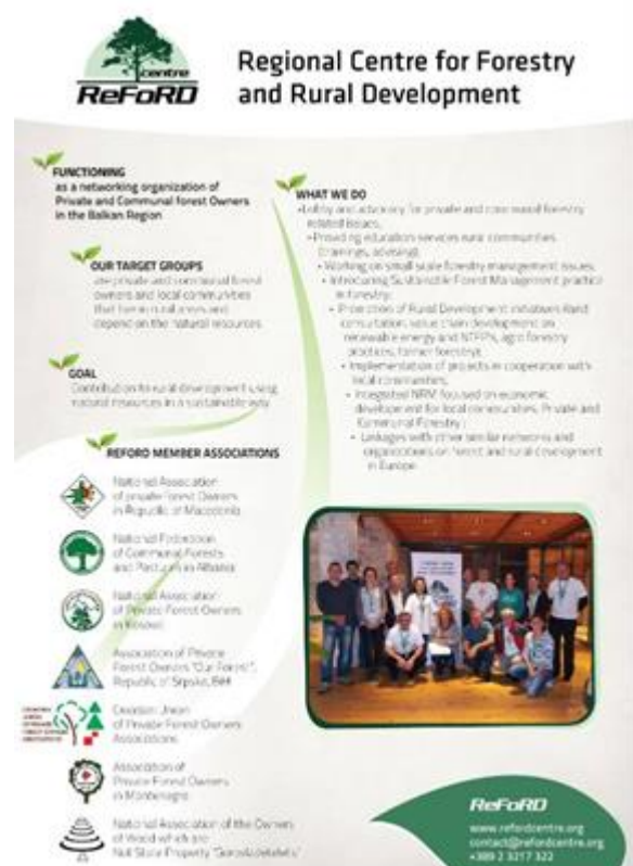
Figure 14: REFORD promotion poster

The associations for private and communal forestry in the different countries are still growing and developing. REFORD as their regional network for family forestry is a young structure that is gradually growing. The whole forestry sector in the regional and proper inclusion of family forestry and sustainable forest management needs further attention.